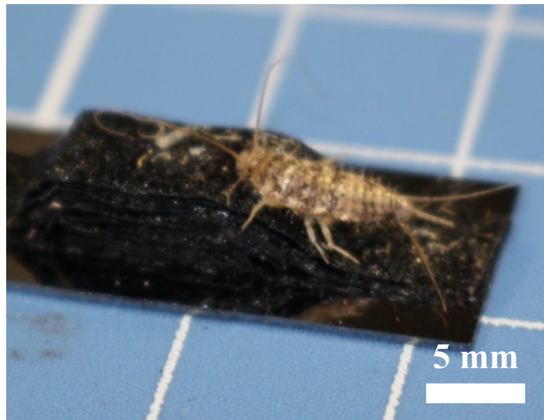
Fig. S1. (Hirai)